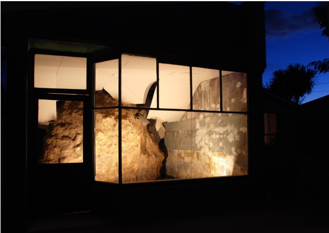
Callum Morton, Monument 19: Sexy Beast, 5th Scape Biennial, Christchurch, NZ, 2008