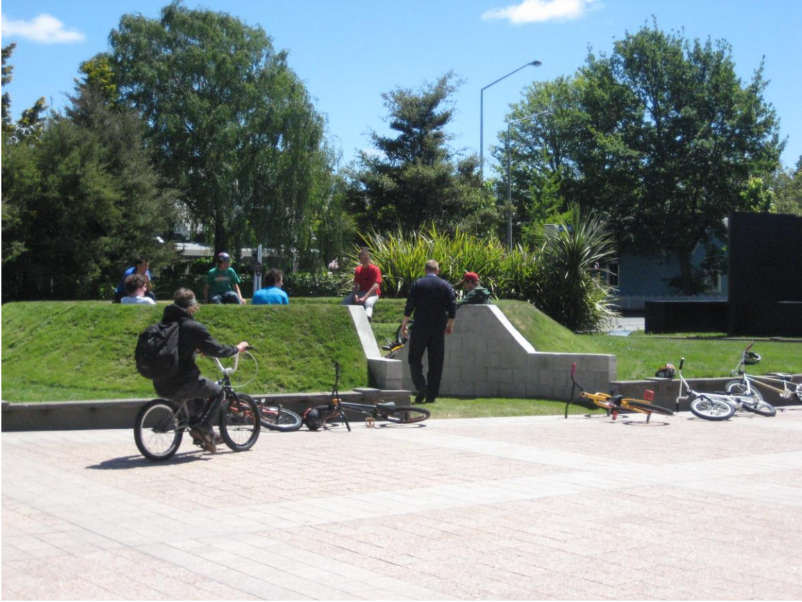
Murat Şahinler&Fuat Şahinler, Breather, 5th Scape Biennial, Christchurch, NZ, 2008