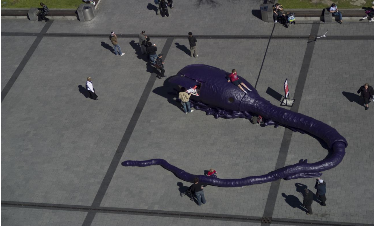
Atelier van Lieshout, Darwin (Info Center), 5th Scape Biennial, Christchurch, NZ, 2008