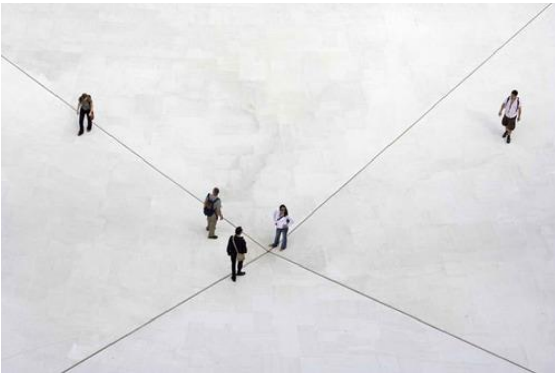
Bruce Nauman, Square Depression, 2007