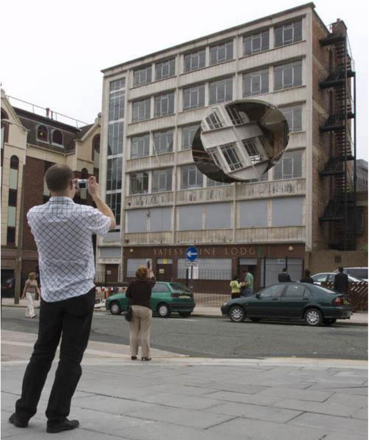
Richard Wilson, Turning the Place Over , 2007