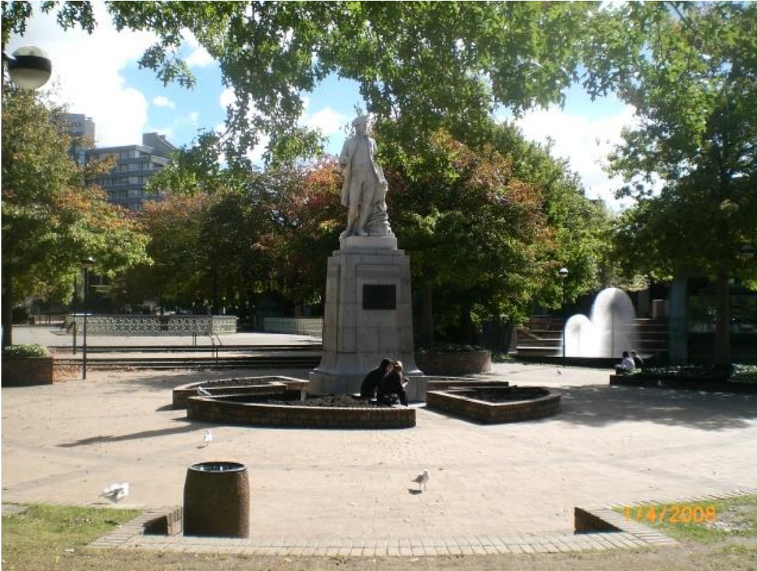
Tatzu Oozu, Enterprise, 5th Scape Biennial, Christchurch, NZ, 2008