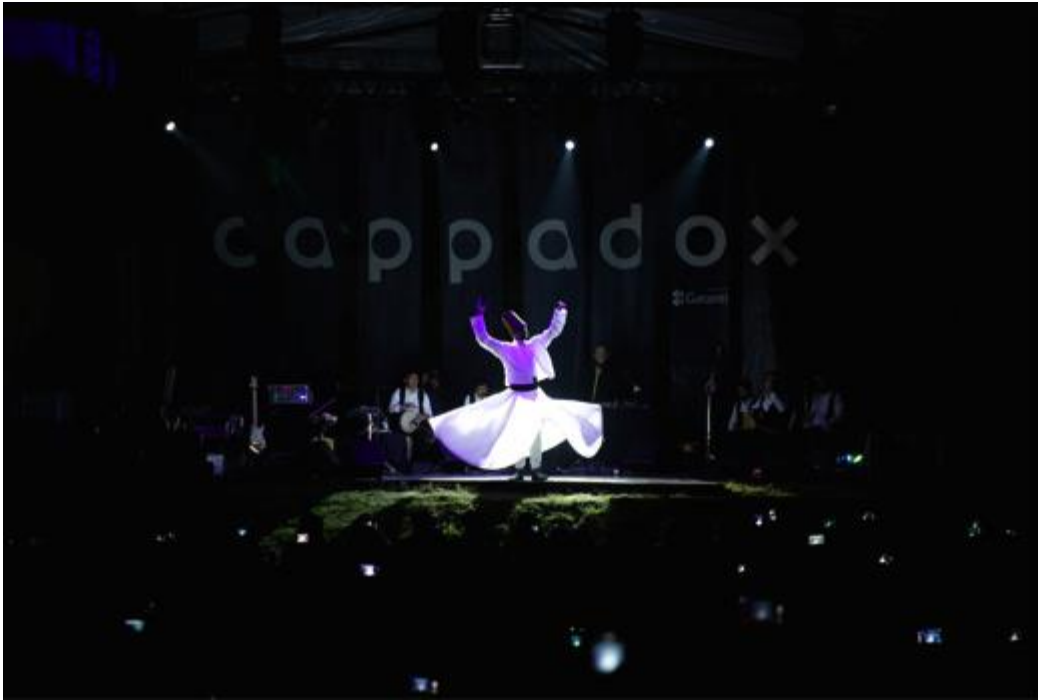
Mercan Dede Performance, Cappadox 2015