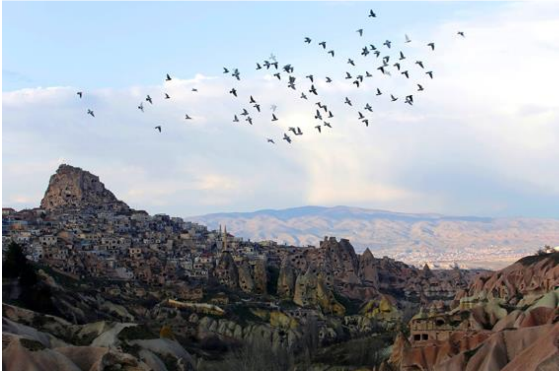
Cappadocia General View

Set in the villages of Uçhisar and Göreme in the stunning semi-arid landscape of Cappadocia, in Central Anatolia, a region of exceptional natural wonders; characterised by ‘fairy chimneys’ and cone shaped rock formations, Cappadox is a destination festival that is perfect for first-timers and experienced festival-goers alike.