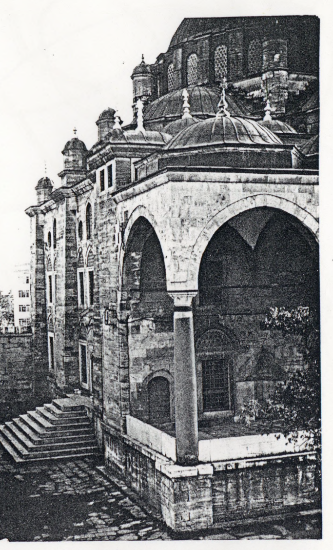
Istanbul. The Mosque of Hekimoğlu Ali Pasha, showing a reused Byzantine granite column cut roughly at the neck to fit the capital.